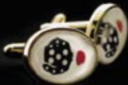
1. CUFFLINKS 18 x 13 mm