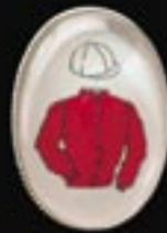
3. BROOCH 25 x 18 mm