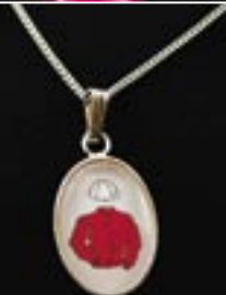
2. PENDANT & CHAIN 18 x 13 mm